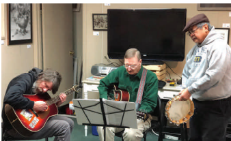
Musical collaborations happened at the weekly “Music Jams”.