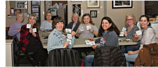
“Funday Mondays” @ GACA lived up to its name.