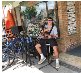
“Random Acts of Music” took place all over downtown Gaylord.