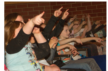
Gaylord elementary school children enjoyed a concert by the group “Trout Fishing in America”

Gaylord Area Council for the Arts 125 E. Main St. ~ Gaylord, MI ~ 49735 989.732.3242 ~ gaylordarts@gaylordarts.org www.gaylordarts.org