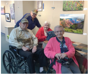
Art lovers from Aspen Ridge visited the Art Center