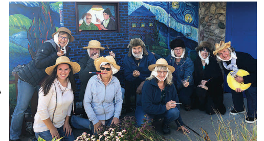
GACA artists dressed up as van Gogh by their creation @ GACA & City Barber Shop.