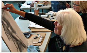
Figure Drawing sessions began at GACA this year.