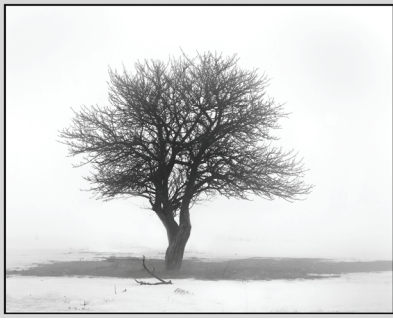
2020 First Place Photo— Traditional Category